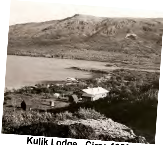
Kulik Lodge - Circa 1956